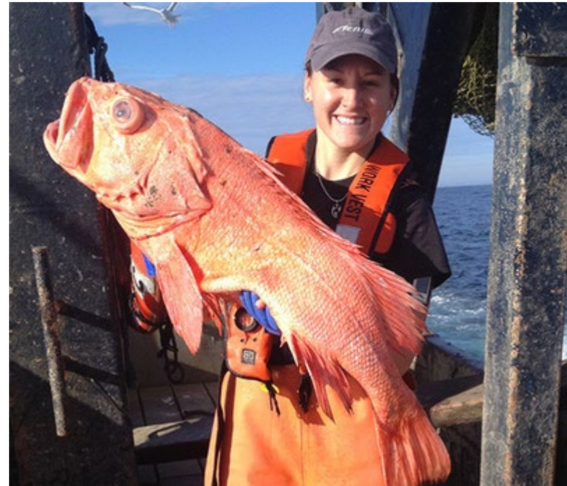
SEFSC Pelagic Observer Program

Disposition: Users are instructed to log every catch, whether it was sold, discarded, seized, or kept for personal use